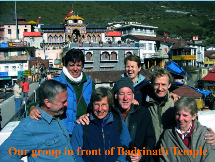
Our group in front of Badrinath Temple

Our InsightSeeing Tour to Badrinath, Valley of the Flowers, Hemkund Sahib, and Mana Village was by any measure, “breathtaking!” One could possibly write heroic stories, dramatic poems and spiritual essays of this journey. It included all. But let us just sum up some impressions and experiences: a beautiful, sometimes bumpy, sometimes scary drive along the Ganges up-north, with – praise the Lord - a very capable driver; stops along the way at serene temples, historical religious places and gorgeous gorges; pilgrims cheering us up with sweets on the long but fulfilling